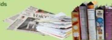
Mixed Paper/ Paperboard