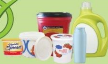
Rigid Plastic #1 & #2 Jugs with screw top lids Tubs with Snap On Lids