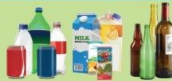
Deposit Items Including: Mix Containers Pop & Beer Cans and Bottles Tetra Paks